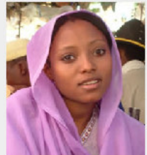
Please pray for the ... Bederia of Sudan

Population: 784,000 Language: Arabic, Sudanese Spoken Religion: Islam Evangelical: 0.00%